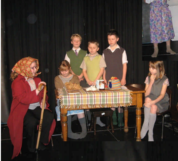
Pictures from the Primary School's World War II drama 'We'll Meet Again'