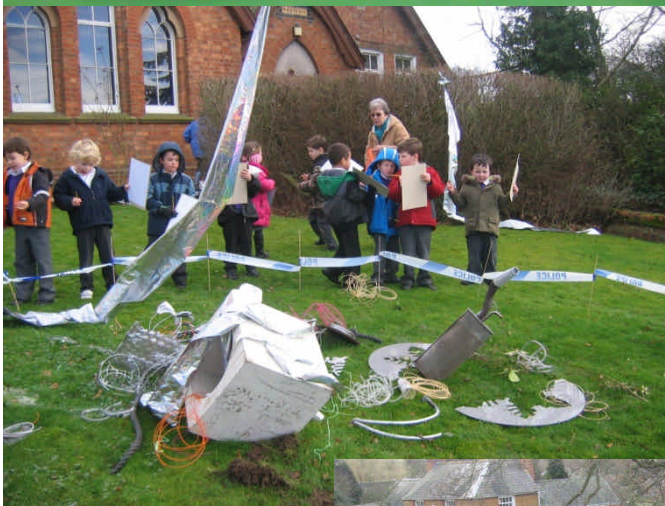
A creative experience was gained by the youngest children when an alien spaceship crash landed on the lawn in front of the school