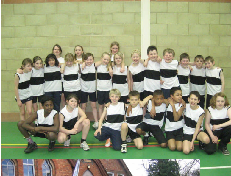
School Athletics Success by the team of 20 children from Years 5 and 6 at the Campion Cluster Sports- hall Athletics Tournament